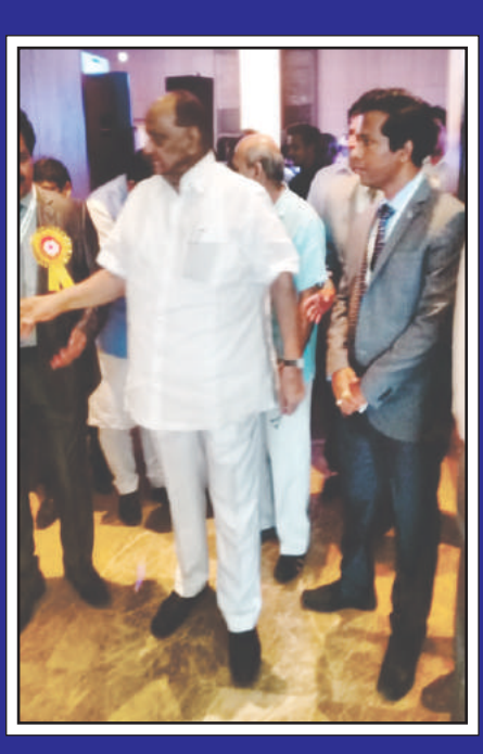
STAI, NEW DELHI 2016